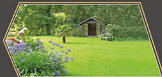
Lawn & plants shall be provided as per project design