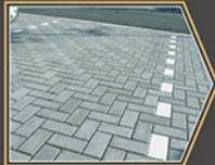
Paving blocks / ceramic tile flooring for parking area shall be provided.