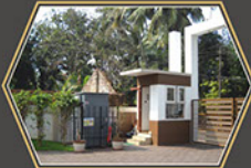
Proper security gate & cabin with 24x7 monitoring devices & compound wall.