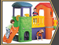
Children play park with play equipments