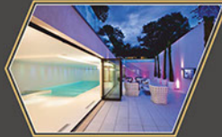
Sky park shall have Party hall, Swimming pool & Landscape area