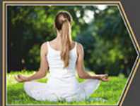
Yoga & meditation area