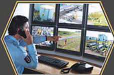
CCTV Security surveillance cameras for children park & game areas.