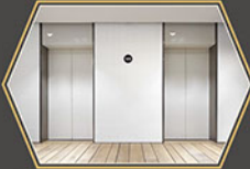
A Six passengers, SCHINDLER or equivalent Automatic 2 lifts shall be provided